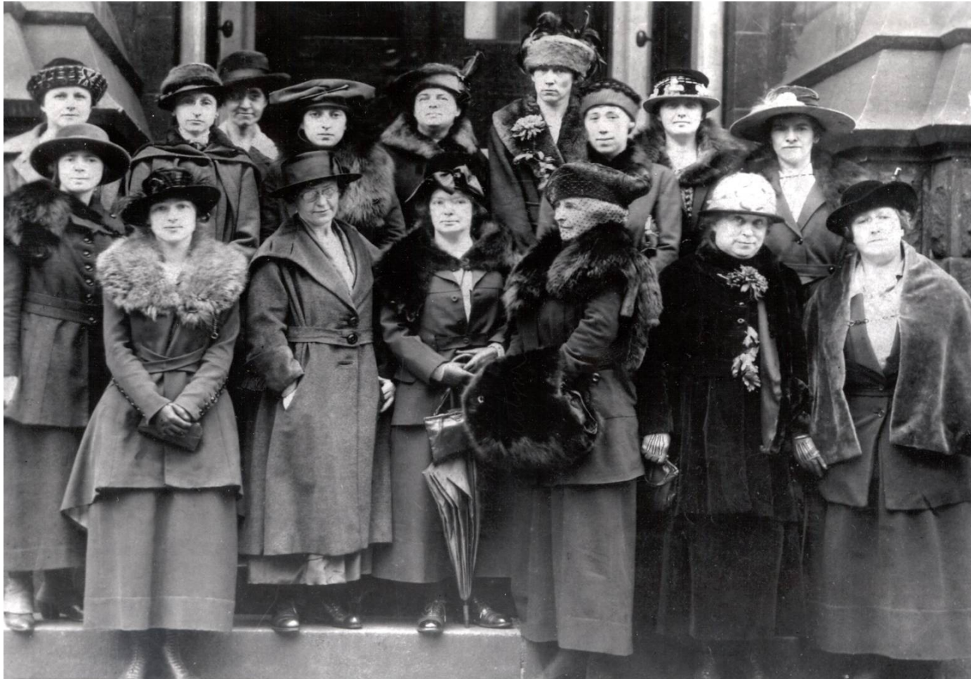
Delegates from the nine Charter Clubs who met in Buffalo, New York at the Statler Hotel on 8 November 1919